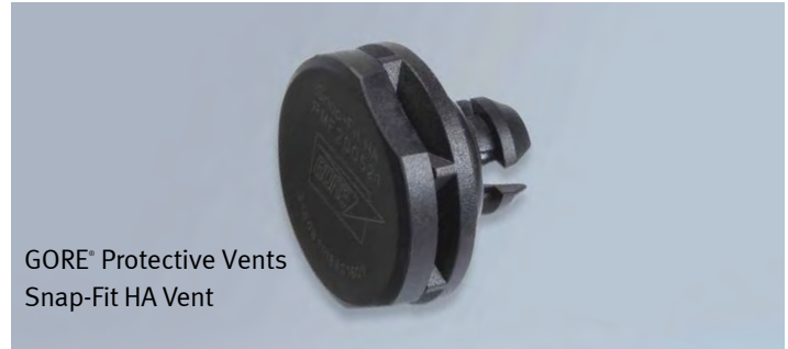
GORE® Protective Vents Snap-Fit HA Vent